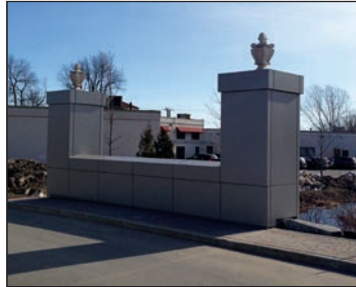
CPHC Bridge After.