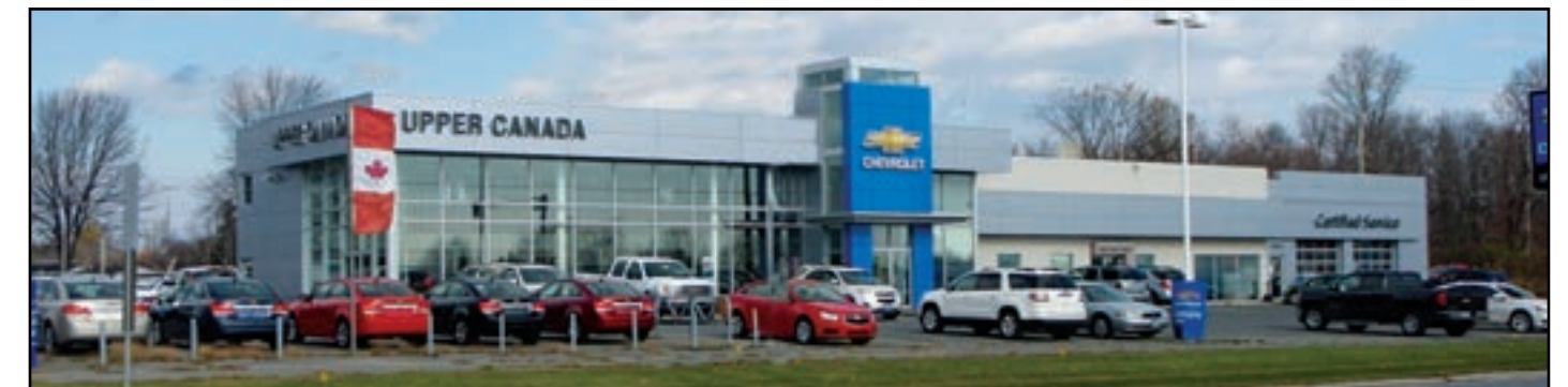
Top Photo: Exterior before. Bottom Photo: Exterior After.