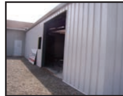
First Addition in 2006

In the past three years, Chevron Construction has added 8000 sq. ft. of assembly area for one of Ontario's fastest growing companies - Dica Electronics in Carleton Place.