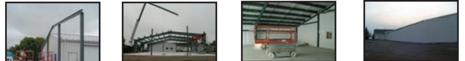
Progression of second Dica Electronics addition.

For more information and photos of this design/build construction project, please visit www.chevronconstruction.com .