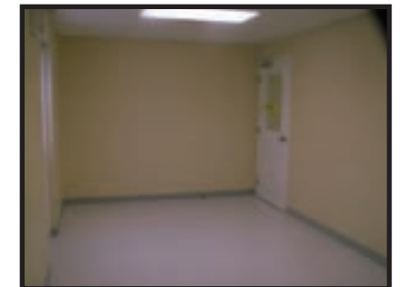
Second Addition in 2008

Less than two years later Dica made a decision to add more workspace. Starting in August 2008, Chevron built a 6000 sq. ft. assembly area. This addition also included two washrooms and a lunch room. The new addition was matched with the same Steelway building as the first addition.